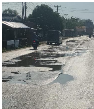
Figure 1. Road Column

The Parit 5 Road section is one of the main connecting roads in Tembilahan Hulu District, Indragiri Hilir Regency, Riau Province. This road has an important role in community mobility and distribution of agricultural and plantation products, especially coconut and areca nut which are the region's leading commodities. The length of the Jalan Parit 5 section that is the object of this study is 800 meters (0.80 km), which begins at the coordinates (0°23'14.57"N, 100°50'40.57"E) – as STA 0+000 and ends at the coordinate point (0°25'26.99"N, 100°48'50.82"E) – STA 0+800. Jalan Parit 5 is a road with 1 lane of 2 lanes as shown in Figure 5.1, where the road body consists of a layer of flexible pavement and concrete road shoulders, with a road body size of 4.00 meters and the left and right road shoulders of 1.00 meters each.