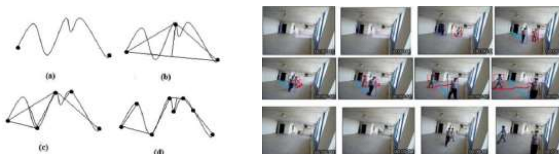
Fig 3. Determining the trajectory of objects.

In trajectory-based video summarization, the moving parts in the video are detected using background subtraction and the binary image is divided into frames. Human detection is performed using a Histogram of Oriented Gradient (HOG) using a Support Vector Machine (SVM) classifier. Then, the movement of people is tracked through successive frames using a Kalman filter, and the trajectory of each person is extracted. Trajectory analysis leads to a meaningful summary that covers only the important parts of the video. You can also specify a region of interest to add to the summary.